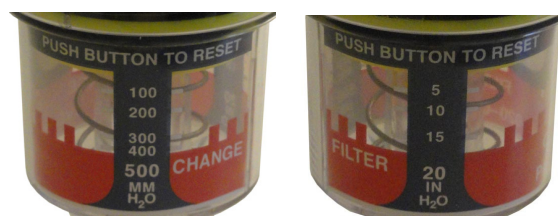
Filter Gauge shows both mm & inches ratings